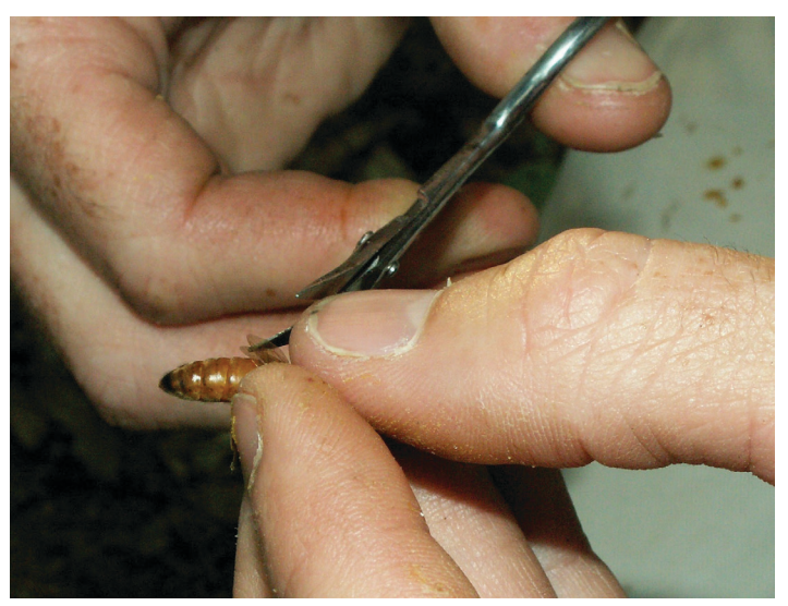
Figure 9. Take a small pair of scissors and cut off ½ of the forewing (the large, front wing) on one side of the queen's body.