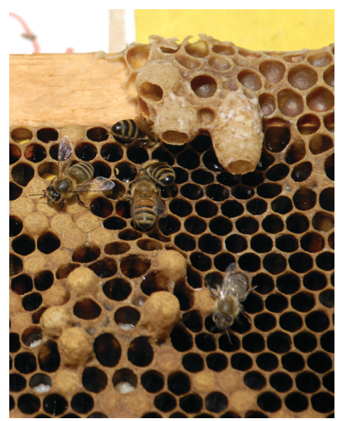
Figure 2. This photo shows two queen cups (no developing larvae present) left-of-center and a growing queen cell (containing a developing larvae) right-of-center.

The colony undergoes a number of changes in preparation for swarming. The queen loses a great deal of body weight (worker bees lower the amount of food they provide to the queen—i.e. they put her on a diet), which will aid in her ability to fly to a new hive site. Furthermore, the queen's egg-laying output decreases significantly. Worker bees in the colony begin to crowd the nest, gorging themselves on honey. Other normal activity, such as foraging, will cease temporarily. An audible pitch begins to develop among the workers and a hive about to swarm is significantly louder than one that is not about to swarm.