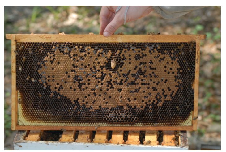
Figure 5. A queen cell within the brood pattern or on the outer edge of the brood pattern is normally, though not always, a sign of queen supersedure.

Queen cells can be produced for reasons other than swarming. For example, workers construct supersedure cells when the queen dies, when her pheromone output decreases, or if she begins to fail. In these instances, worker bees will try to rear a queen from young larvae that are already developing into workers. If worker bees change the path of a young worker larva to that of a queen at a young enough age, the resulting queen will develop normally. If, however, the workers try to make a queen from an older worker larva, the resulting queen likely will be inferior. Because of this, workers typically make supersedure cells at the perimeter of the brood pattern, because this is where the youngest worker larvae typically reside (Figure 5). As with everything in nature, there are always exceptions and you may find supersedure cells along the edge of the frame (or normal queen cells within the brood pattern).