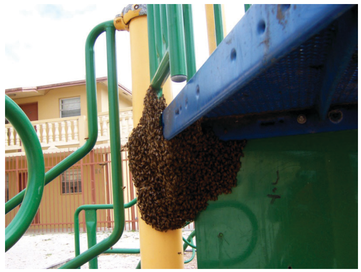
Figure 1. A swarm of bees has clustered on playground equipment.

Good colony management includes swarm prevention. Proactive beekeeping practices to alter colonies in response to potential swarming behavior must be undertaken regularly during the swarm season. Good management maintains strong colonies and allows for greater honey production and the potential to split and increase the total number of the beekeeper's colonies, all of which makes beekeeping much more profitable for hive owners.