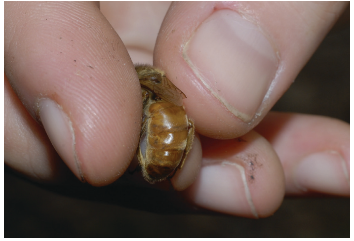
Figure 7. A healthy queen with her wing clipped to prevent her from leaving the colony with the swarm.

Clipping a queen's wing is a good way to minimize swarming tendencies in colonies (Figure 7). Since it usually is the old queen who leaves the colony with the swarm, clipping a queen's wing keeps her from being able to leave with the swarm. To clip a queen's wing, hold the queen between the thumb and pointer finger as seen in Figure 8. Take a small pair of scissors and cut off ½ of the forewing (the large, front wing) on one side of the queen's body (Figures 8 and 9). A clipped queen will try to leave the colony with a swarm, but she will not be able to fly away with it, and the swarm will return to the nest. Frustrated swarms (those that cannot "coerce" their queen to swarm because she is clipped) often kill their queen in an attempt to rear one that can fly. So, clipping a queen's wing is more of a safety net than a method of reducing the swarming tendency. This technique is most effective in controlling swarms when other swarm control methods are practiced at the same time. Worth noting is that a clipped queen sometimes will be unable to reenter the colony after a failed swarm attempt. In this instance, she will climb up a nearby bush or under the colony where the swarming bees will cluster around her. These swarms are easy to capture and can then be housed in a new hive. One should not try to reintroduce the swarm back into the parent colony. Once a colony tries to swarm, it will continue to do so.