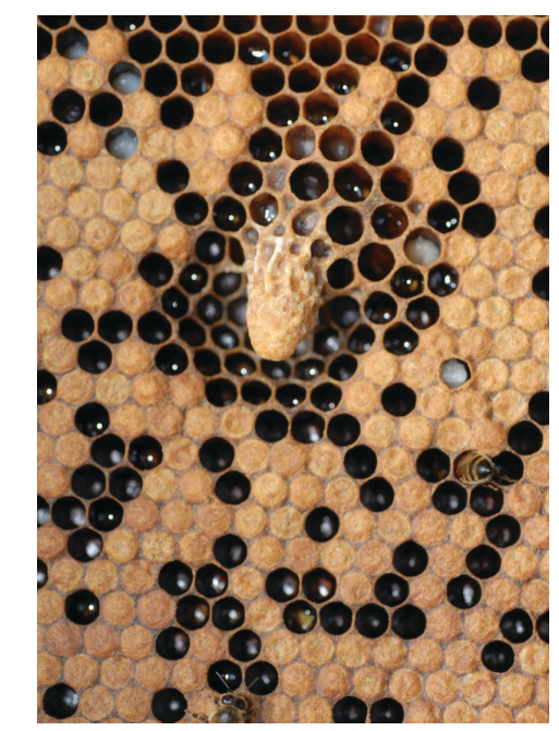
Figure 3. A capped queen cell.

During the swarm, about 50%–70% of the worker bees rush out of the hive (though this percentage varies), herding the old queen out as they go. The old queen takes flight, lands on a nearby structure (tree branch, fence post, etc.), and the worker bees circling around her land on her, forming a cluster typically ranging in size from a softball to considerably larger than a basketball. The cluster remains at this location, sending scout bees out to find a suitable cavity in which to build a nest. Once such a cavity is found (a process that can take minutes or up to 4 days), the entire cluster flies to the site in one circling mass. The original, "parent"