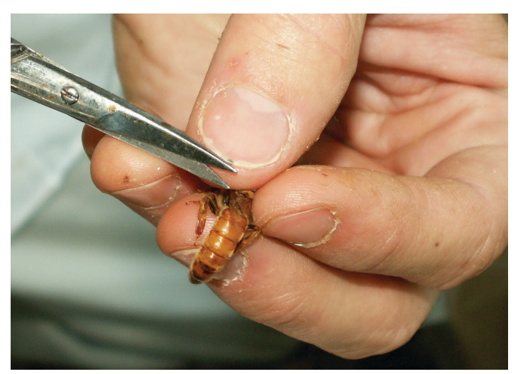
Figure 8. The proper position in which to hold a queen to facilitate wing clipping.

containing brood should be removed from its respective super and the bees shaken from the frame (over the hive body) with 1-3 quick shaking motions. It is important to shake as many bees from the frame as possible because bees can easily hide swarm cells on a frame. If one queen cell is missed and allowed to be capped, the hive will be prompted to swarm. It only takes about seven to ten days for new capped queen cells to develop, so it is important to repeat this process weekly.