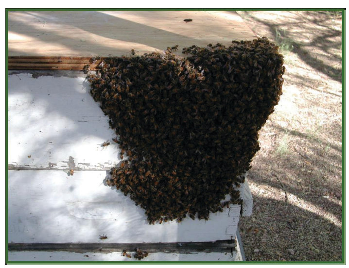
Figure 6. Usurpation of a European honey bee colony by an African honey bee swarm.

What's in a name? In popular literature, "African," "Africanized," and "killer" bees are terms that have been used to describe the same honey bee. However, "African bee" or "African honey bee" most correctly refers to Apis mellifera scutellata when it is found outside of its native range. A. m. scutellata is a subspecies or race of honey bee native to sub-Saharan Africa, where it is referred to as "Savannah honey bee" given that there are many subspecies of African honey bee, making the term "African honey bee" too ambiguous there. The term "Africanized honey bee" refers to hybrids between A. m. scutella and one or more of the European subspecies of honey bees kept in the Americas. There is remarkably little introgression of European genes into the introduced A. m. scutellata population throughout South America, Central America, and Mexico. Thus, it is more precise to refer to the population of African honey bees present in the Americas as "African-derived honey bees." However, for the sake of simplicity/consistency, we will refer to African-derived honey bees outside of their native range as "African honey bees" or "AHBs".